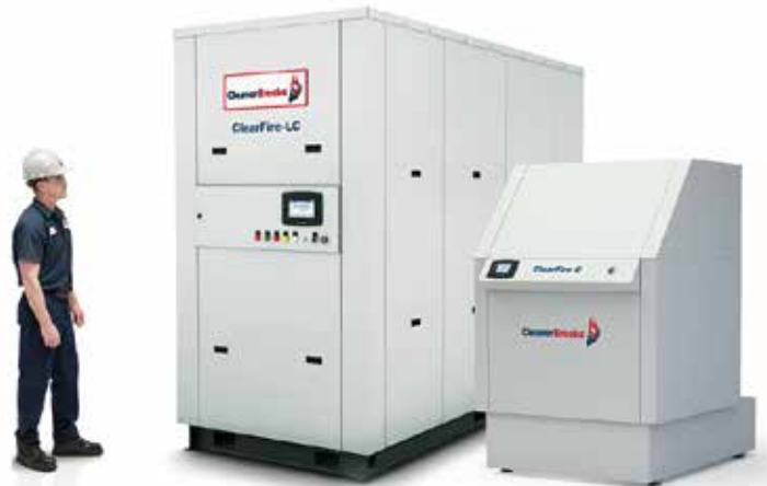
There is a hydronic boiler solution for almost any commercial application.

To locate a representative, visit cleaverbrooks.com or call (800) 250-5883.